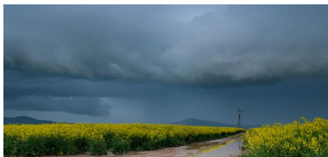
"Rain and Canola" by Bennie Viviers COM at SAVAS International Salon