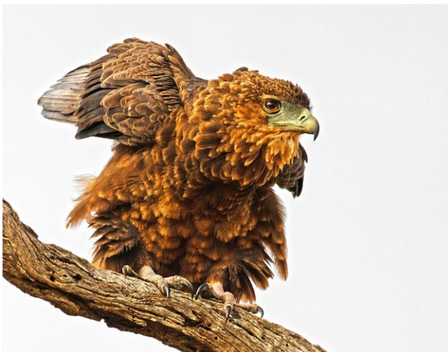
"Juvenile Bateleur" by Derrick Smit

Certificate of Merit at 18 th Up and Coming PSSA Salon