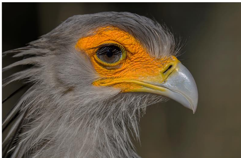
ABOVE: "The eye of a secretary bird – And RIGHT: "Thirsty"