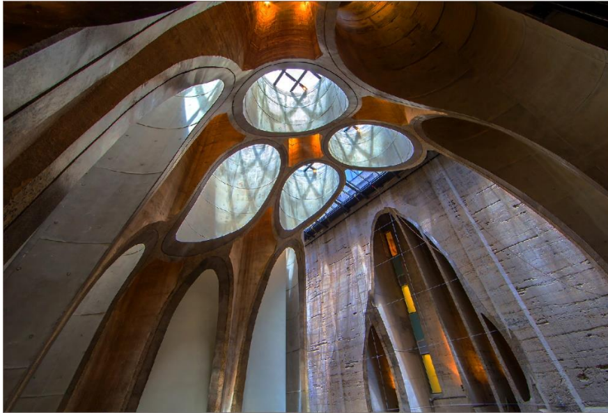
Zeits Dome by Neels Beyers Certificate of Merit At Brandpunt Salon