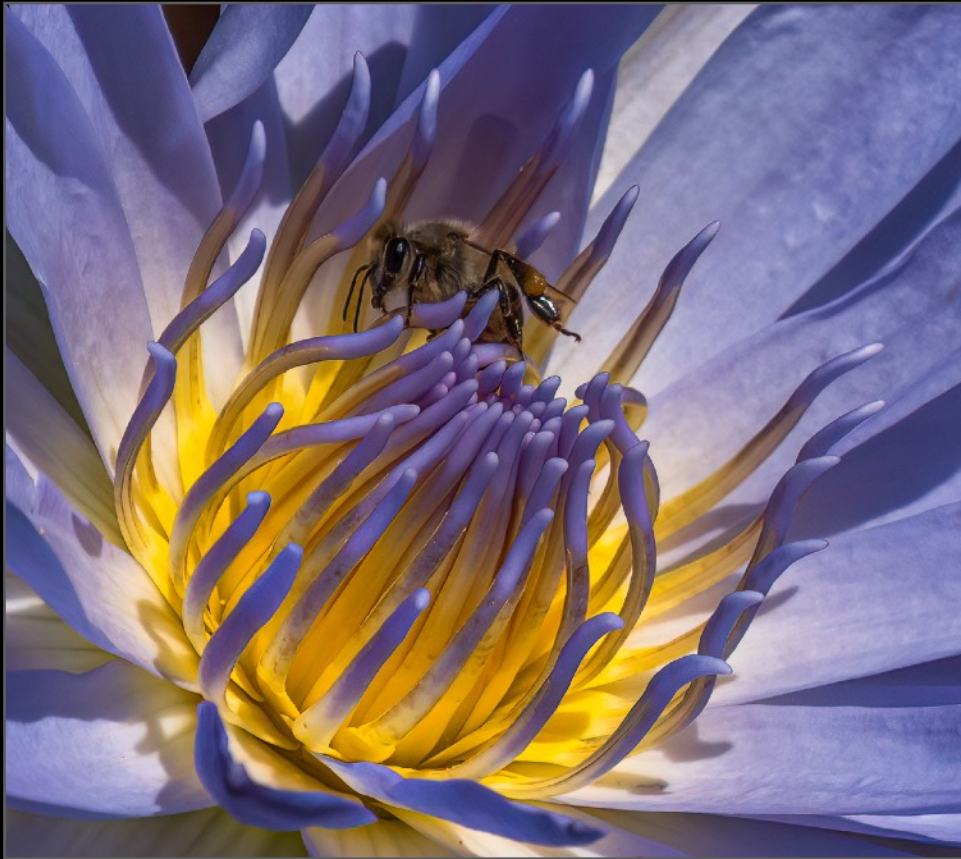
On top of the lily by Pieter Swart

German International Photocup (GIP) 2024- Honourable Mention