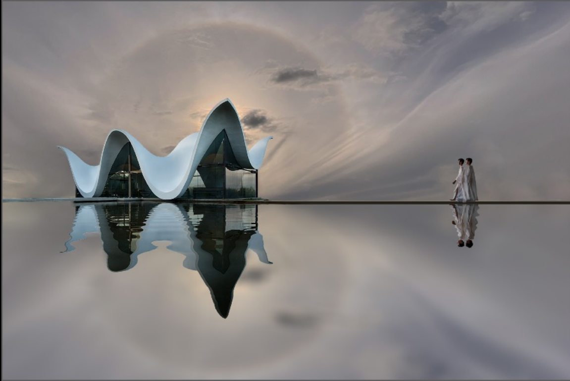
Dreaming of a white wedding by David Barnes