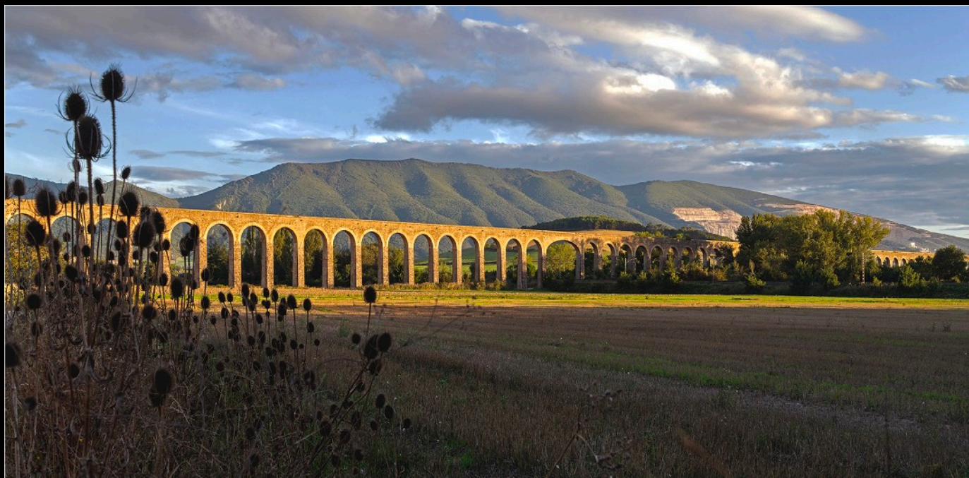
27 Aqueduct by Eric Seket