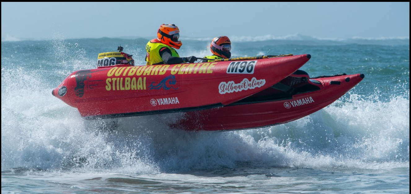
27 Stilbaai by Bennie Vivier