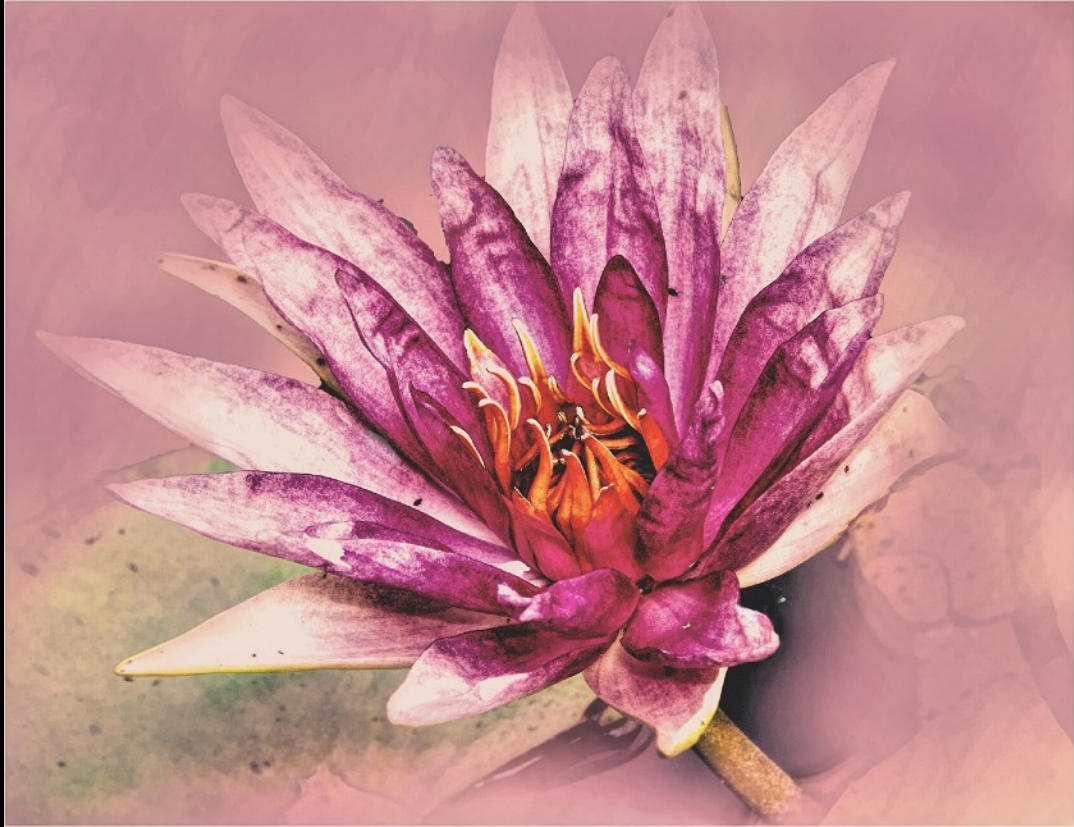
27 Waterlilly by Marleen la Grange