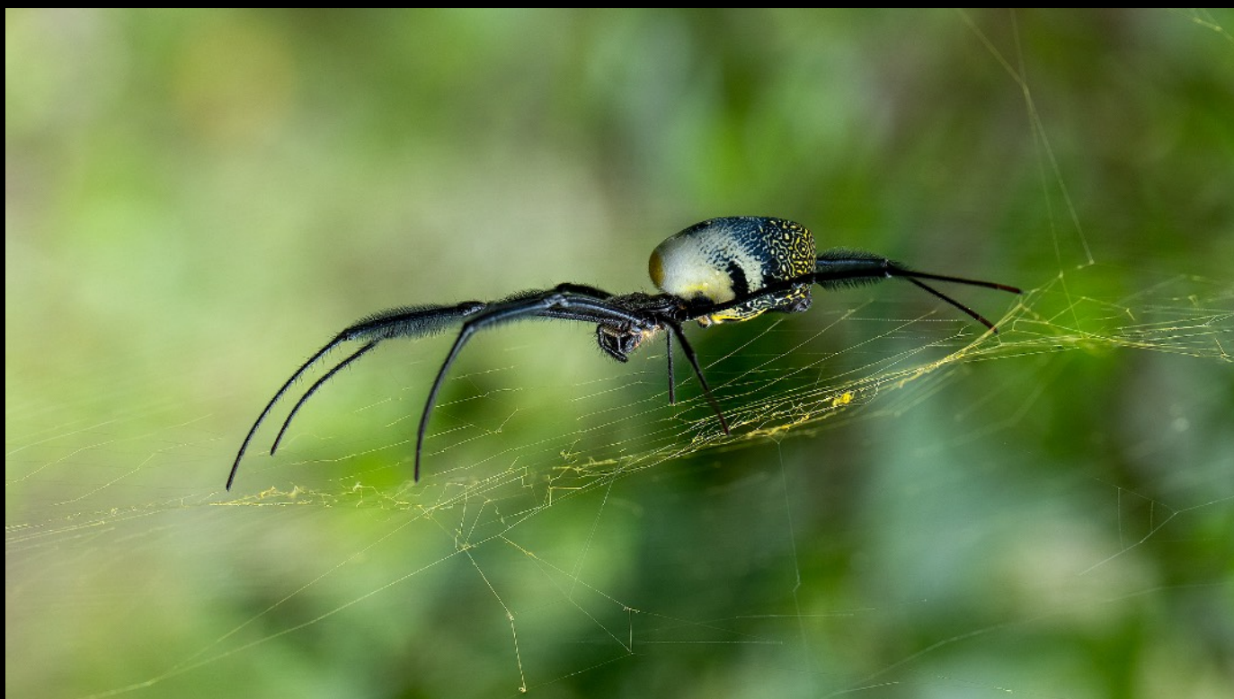
27 Golden orb spider nr 2 by Bennie Vivier