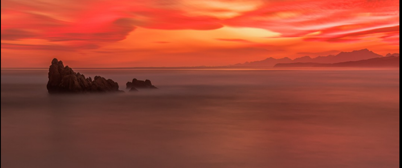
The solid rock by Pieter Swart 6th Nelspruit PDI Salon 2024 - RUNNER-UP CLUB MEDAL