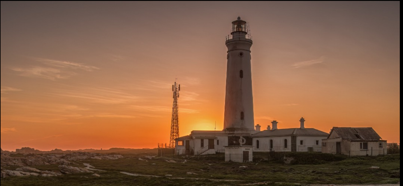
Lighthouse at sunset by Pieter Swart 3rd Benoni Camera Club Digital Salon 2024 - COM 4th Witzenberg Photographic Society National Salon 2024 - COM