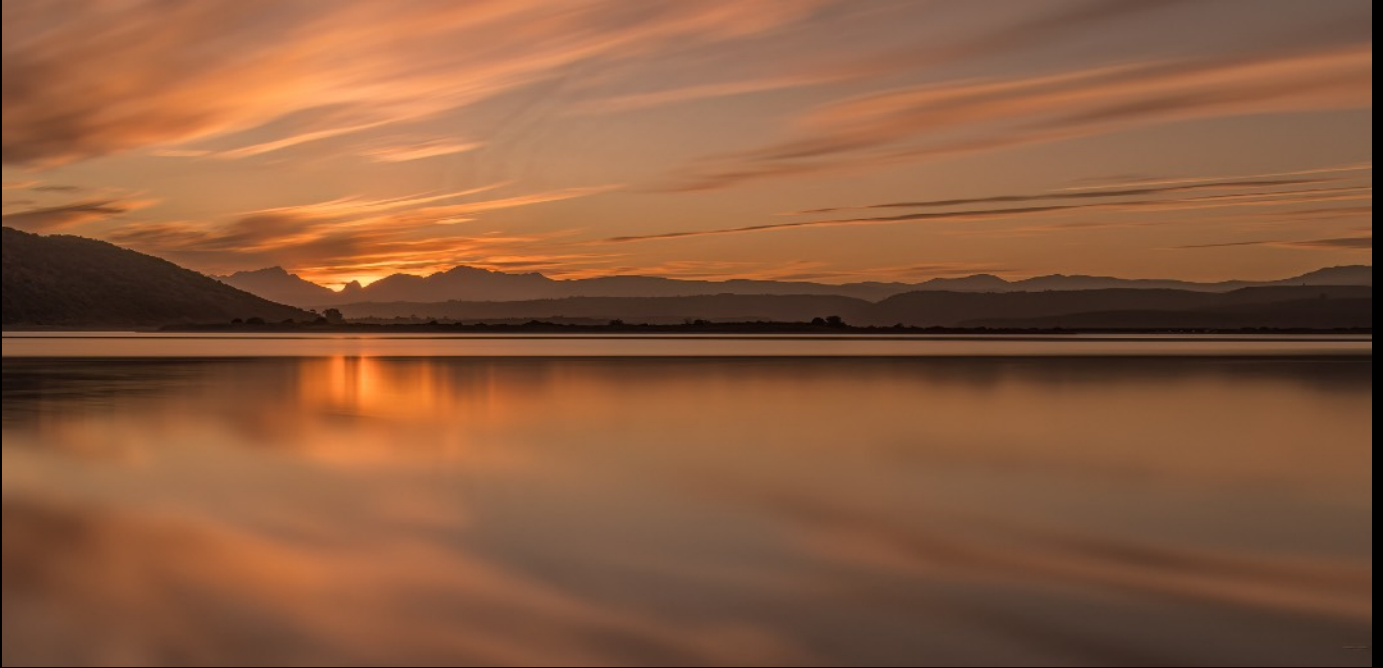
Reflections on the lake by Pieter Swart 3rd Benoni Camera Club Digital Salon 2024 - COM