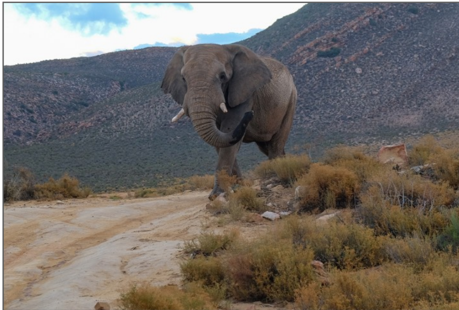
Fuji X-T10, 18-55mm kit lens, f4.0 , 1/160sec, ISO 400

This is the image that won him the acceptance: