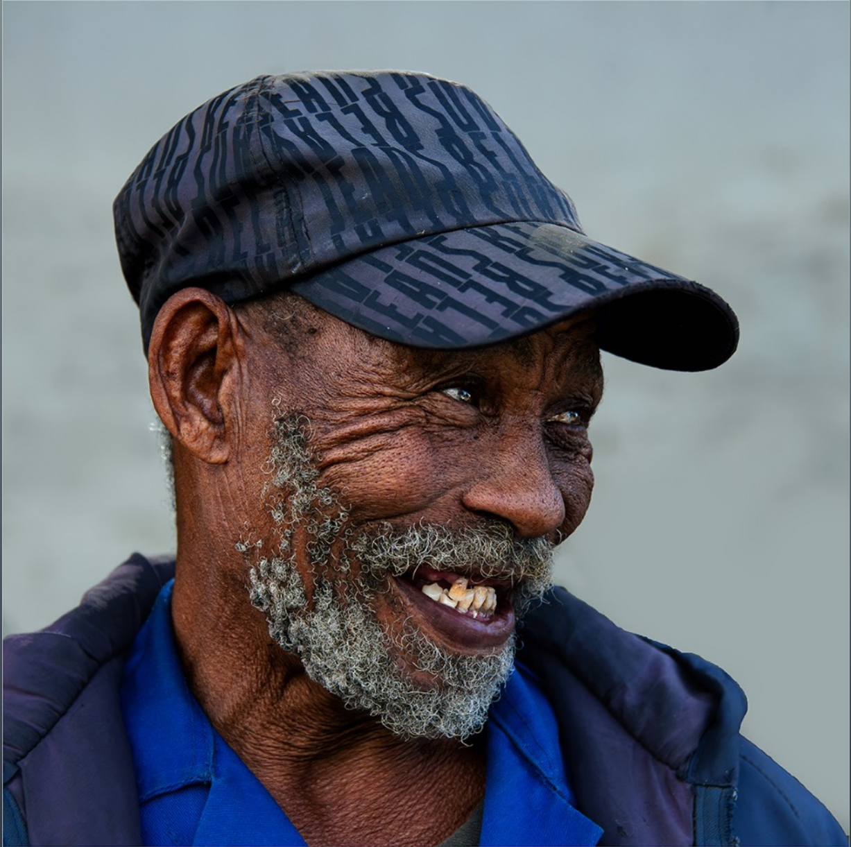
Still smiling by Desmond Labuschagne

Official newsletter of the Tygerberg Photographic Society