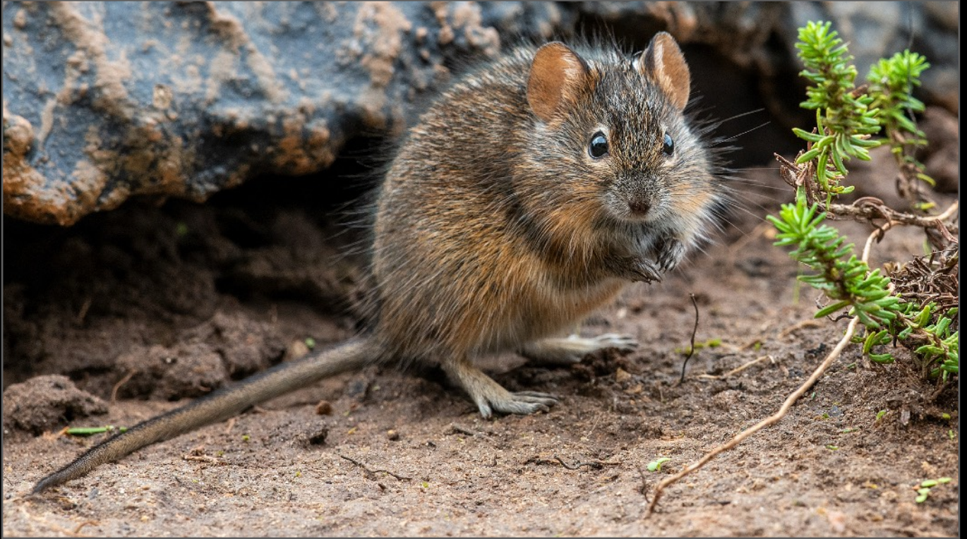
Mouse in the garden by Bennie Vivier