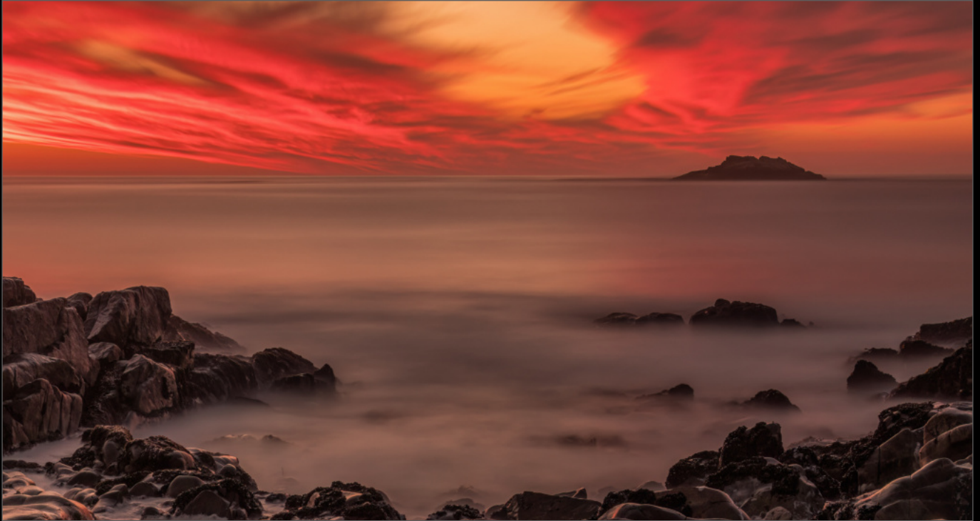
COM 2ND HIGHWAY PDI SALON Colourful around the rock by Pieter Swart