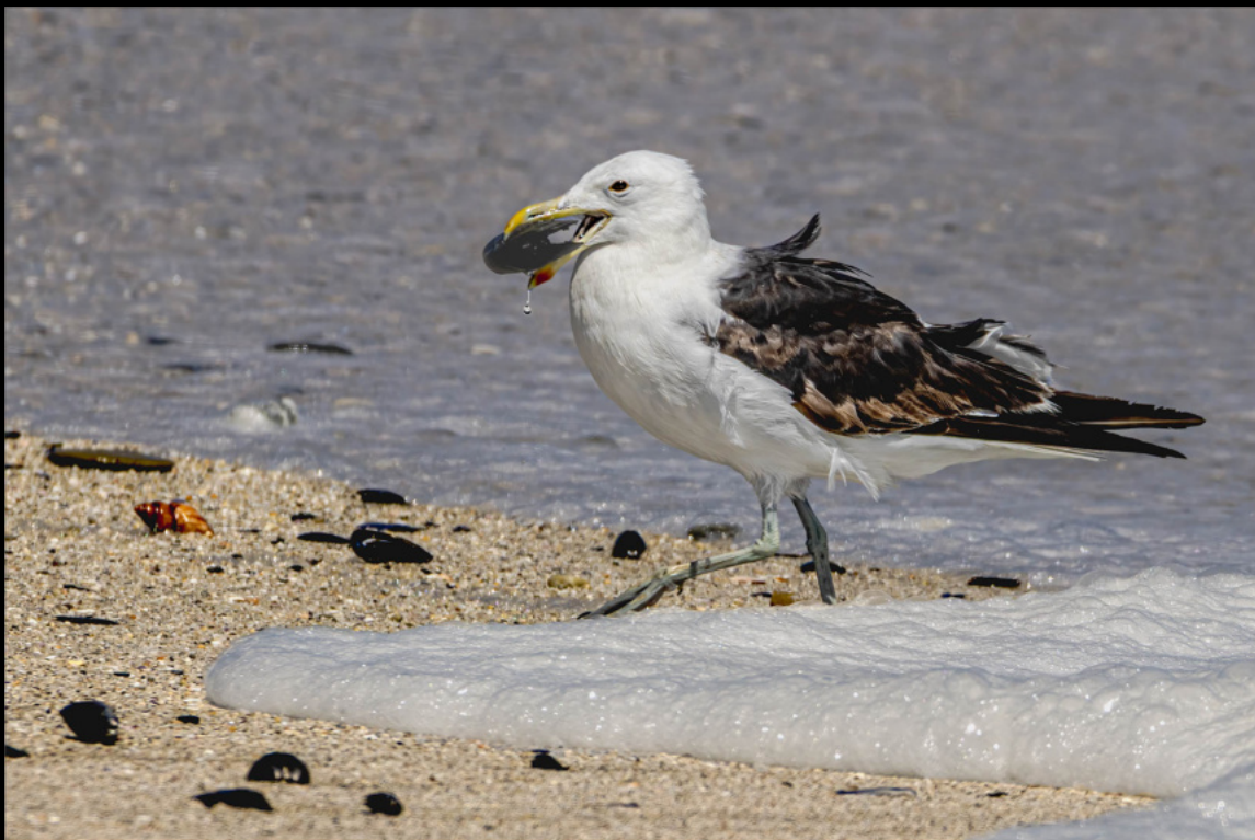
COM TPS MARCH CLUB COMPETITION Let's get out of here by Louis Jones