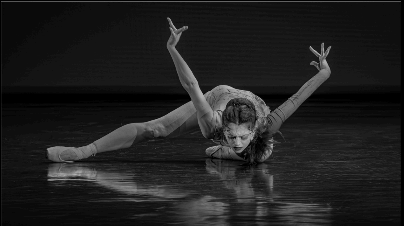
COM 5TH FOTOKLUB SALON End of performance BW Lighter by Francois du Bois