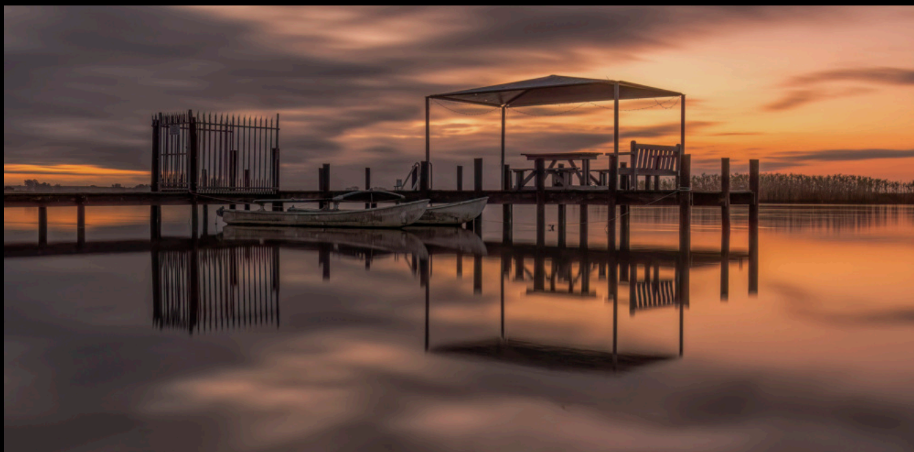
COM TPS MARCH CLUB COMPETITION Peaceful at the river by Pieter Swart